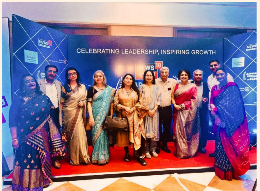
ROTARY CLUB OF CALCUTTA INNER CITY