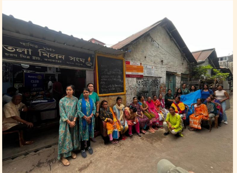
Health checkup camp with medicine distribution at Sonagachi by Robin Hood Army in association with Rotary Club of Calcutta Inner City. Total 50 patients have been checked.